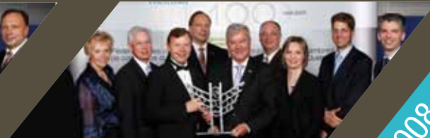
Large business - Artopex inc. (Eastern Townships)