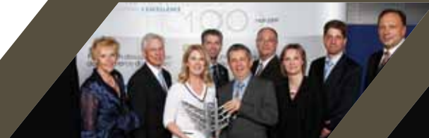
SME - Bleu Lavande inc. (Eastern Townships)